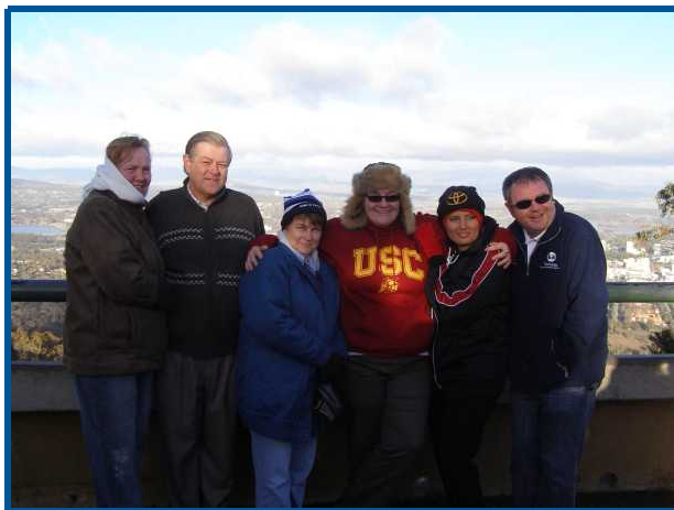
The staff, atop Mount Ainslie

At Wyong, our dinner stop, farewells and thankyou's were said before the long, overnight trip home.