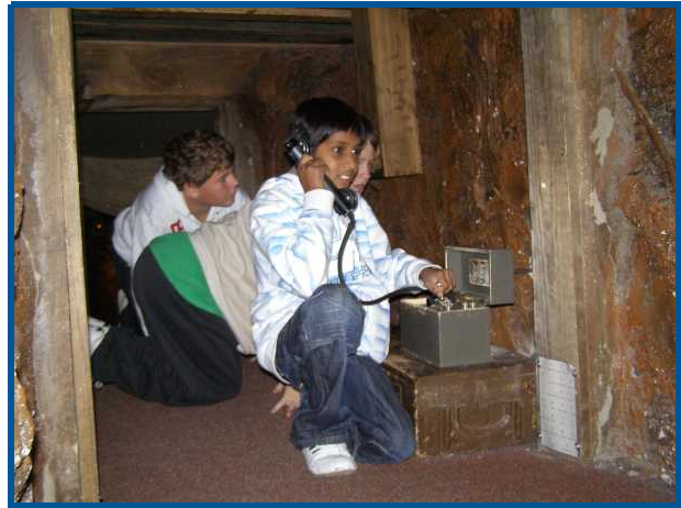
Telephoning a report from a World War One trench

The Australian War Memorial, was as usual a visual and emotional highlight, but this time it included a visit to the Discovery Zone – a hands-on place to experience aspects of our military history.