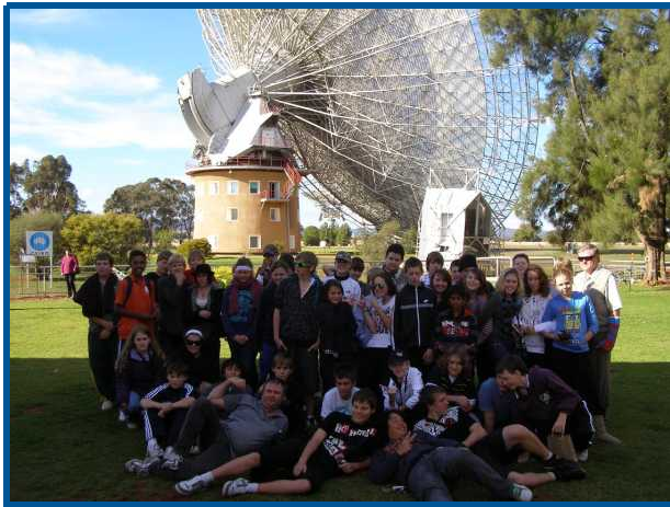
Our first group photo, at “The Dish”, outside Parkes

We had a warm start with just 8° for our morning walk, and after talking to the animals, lunched at “The Dish” before the final dash to Canberra and the opportunity to settle into our accommodation for the next five nights.