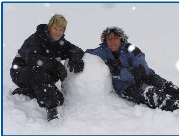
Our big snowball

On the Friday, the snow at Perisher was deep, but hard on the toboggan run. It snowed and winded on us for most of the day, resulting in an ahead of schedule departure to benefit those who discovered what cold really meant and did not appreciate it.