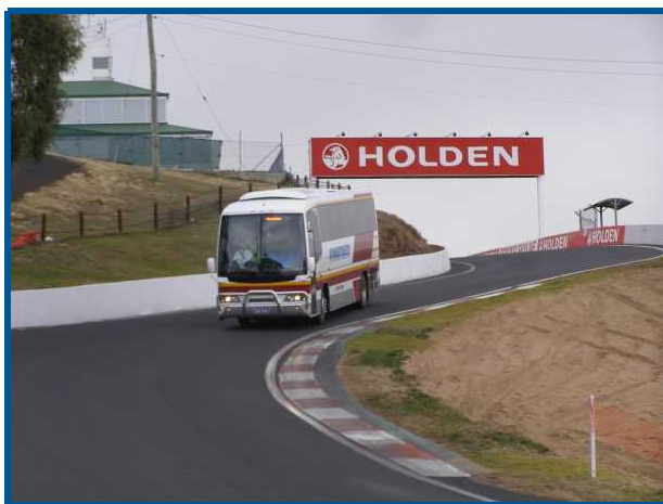
Mount Panorama – lap two

Our trip home again took us via Cowra, but we overnighed at Bathurst this year, straight after two laps of the Mount Panorama racing circuit (two, because a camera battery failed at a crucial moment!) and some spending time at the Motor Racing Museum shop.