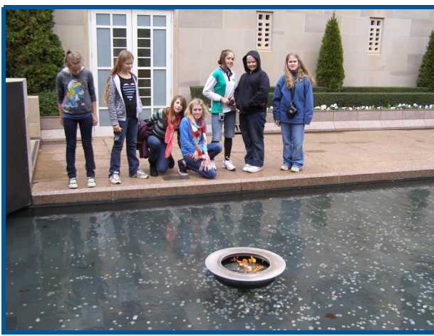
The eternal flame in the Pool of Reflection

The Australian War Memorial, was as usual a visual and emotional highlight, but this time it included a visit to the Discovery Zone – a hands-on place to experience aspects of our military history.